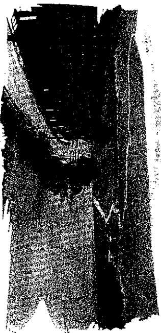
Seven miles of the Lincoln Highway in sight near Bedford, Pa. The drive across Pennsylvania is one of unsurpassed beauty