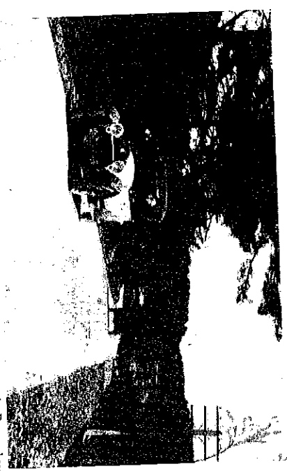
The official Lincoln Highway Packard on a new stretch of concrete in Pennsylvania.