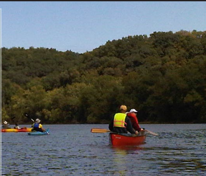
RTCA-led paddling trips on the Monongahela River