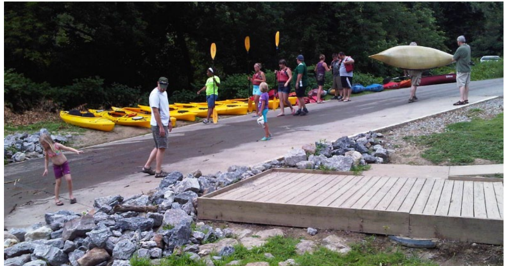
The Ohio River Trail Council's Community Day at the Lock 57 Community Park on the Beaver River near Glasgow, PA.