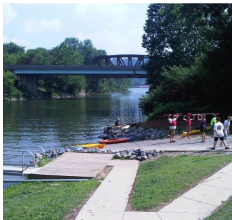
The Ohio River Trail Council's Community Day at the Lock 57 Community Park.

41 miles of parallel bike trail and water trail from Coraopolis PA to 'Point of Beginning' (PA-OH-WV line), and a vision for an interconnected system of over 100 miles of land and water trails in PA-OH-WV.