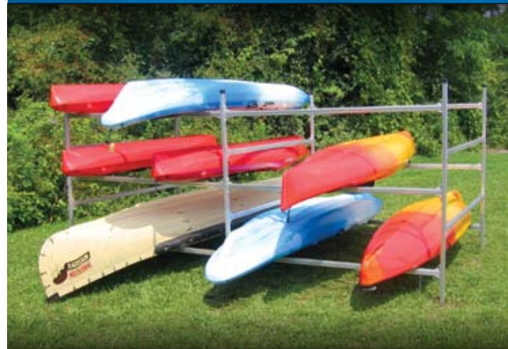
Model SUT-3BR shown with SUT-3BRE Extensions linked

THE CANOE/KAYAK BOAT RACKS LIKE NO OTHER