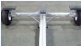
Inflatable kit option