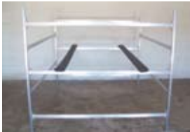
Wood bunks for 3 and 4 boat racks (1 set)