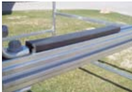
Vinyl crossbar option for 3 and 4 boat rack