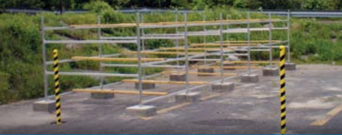
Model SUT-3BR shown with SUT-3BRE Extensions linked