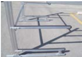
36" Arm assembly for wall rack